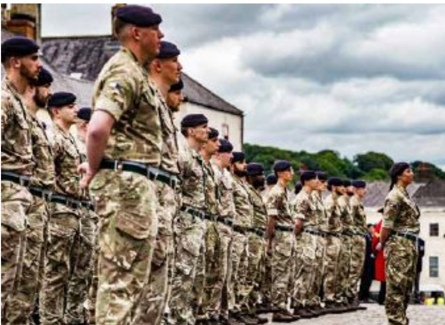
Troops and Veterans on parade.