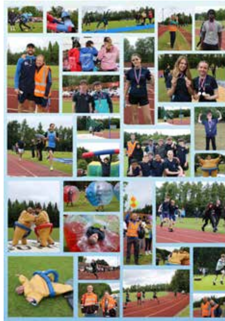
Sports Day Photo Montage.