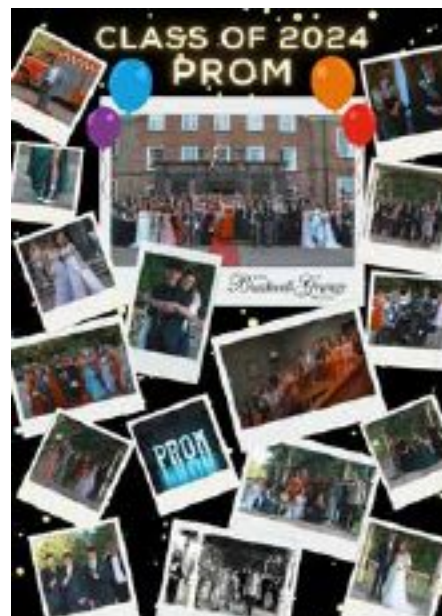
Prom Photo Montage.